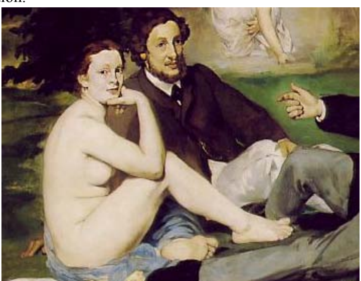
Figure 2: Detail of Edouard Manet's Le Déjeuner sur l'Herbe (Luncheon on the Grass)

little bird. In this scene, the protagonist is introduced and his relationship with the reader starts to be forged. The image portrays a boy, seated on the grass, surrounded by nature (flowers, trees, a lake in the background), his body covering most of the spread. The comics' panel structure continues, but instead of each image portraying a scene of the story, they all form the pieces of a mosaic that constitutes the portrait of the boy, merging the comic book format with the full-page illustration typical of picturebooks. McCloud (1994), building on the terminology by Eisner (1985), defines comics for the sequential nature of its images. While the presence of several panels in one spread reinforces the characterization of this text as a comic, the lack of temporal relationship between the panels challenge it. According to McCallum (2008), "the white space is the liminal space between fiction and reality" (190), so the gutter constitutes a barrier between the world of the reader and that of the character. The boy is imprisoned by the white "bars" and forced to stay in the universe of fiction.