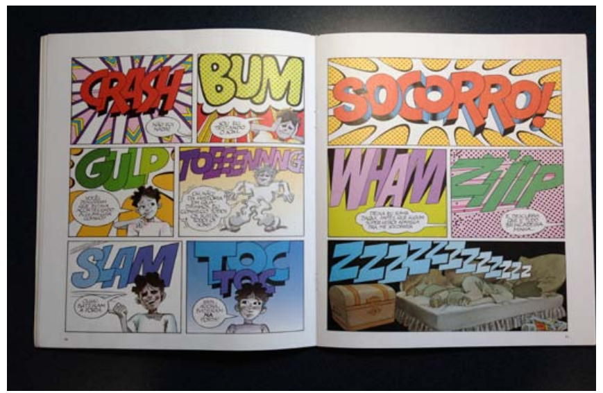
Figure 5: The Panel Boy , pages 10-11.

a further softening of the boundaries between fiction and reader, but the reader is, here, left to decide.