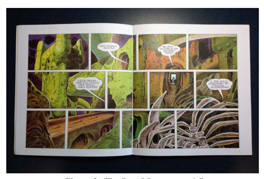
Figure 3: The Panel Boy , pages 6-7.

A final detail cannot go unnoticed in this image: at the panel positioned at the boy's chest, there is a visual and sound effect: the word "ZAP" appears over a spiky and colourful bubble. These effects seem to suggest the appearance of the boy in the story, as if a magic or special introduction. The positioning of this effect is again dubious, it could be an illustration in the boy's shirt, which can indicate his appreciation for comics, or it can be a narrative feature enhancing his entrance in the story, therefore creating ambiguity between what is represented and how it is represented, or the story and the discourse.