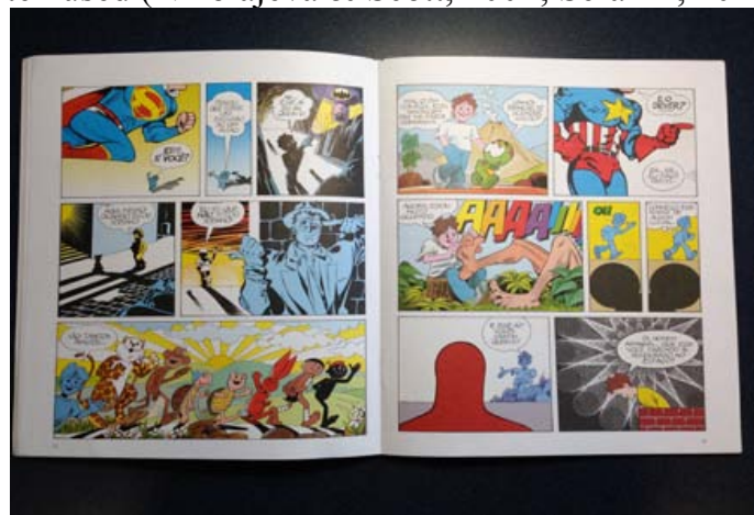
Figure 6: The Panel Boy, pages 12-13.

context, often in subtle ways" (Desang 42). When these allusions refer to a visual text, such as a piece of visual art or the visual aspect of a multimodal text, the term intervisuality is often used (Nikolajeva & Scott, 2001; Serafini, 2016).