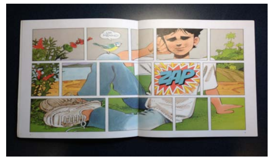
Figure 1: The Panel Boy , pages 4-5.

On the first page of the story, the images are presented in panels, as a comic, but the story starts with "Once upon a time...", said on the first panel by a bird passing far in the sky. While fairy tales are in the literary genre level and comics in the book genre, typically fairy tales are presented in picturebook form, therefore a fairy tale comic book breaks reader's expectations, generating unfamiliarity and a subtle suggestion for readers to reflect on the nature of the narrative. The images, however, don't show typical fairy-tale elements, except perhaps for the fact they invoke childhood; a kite, a dog, a soccer ball, a skate and dirty sneakers suggest the universe of a child, most probably a boy (in Brazil, kites, skates, and soccer balls are usually considered boys' toys). The elements are very concrete and don't make any reference to a magic or fantastic world, except, perhaps, for the presence of a talking bird as narrator.