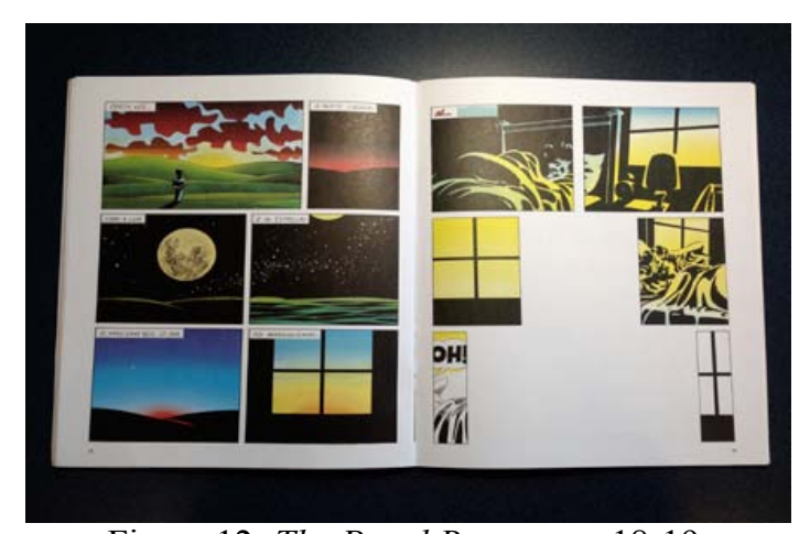
Figure 12: The Panel Boy , pages 18-19.