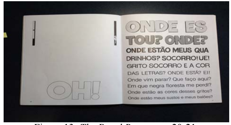
Figure 13: The Panel Boy, pages 20-21.

The introduction of intertextual references of works of children's literature where the verbal narrative is dominant starts a process of transition from the comic universe to the prose universe. This process will be represented visually by the shrinking of the panels and the increase of the gutter space (18-19). On the next spread, there is almost nothing left of the comic world and the verbal