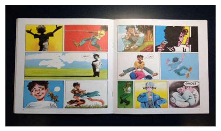
Figure 11: The Panel Boy , pages 16-17.

to have outlined many of the features of postmodernism that are still in vogue nowadays (Doris, 2014). Lichtenstein questioned the relationship between fine and commercial arts by bringing images from comics to the walls of art galleries. By expanding small frames into large-size paintings, he explored the Ben-Dey dots, typical of the printing process of comics, on the faces of comics' sexy nymphs. Ziraldo contributes to this conversation by doing the inverse movement, and bringing the aesthetics now attributed to this of fine art movement back to the comic book.