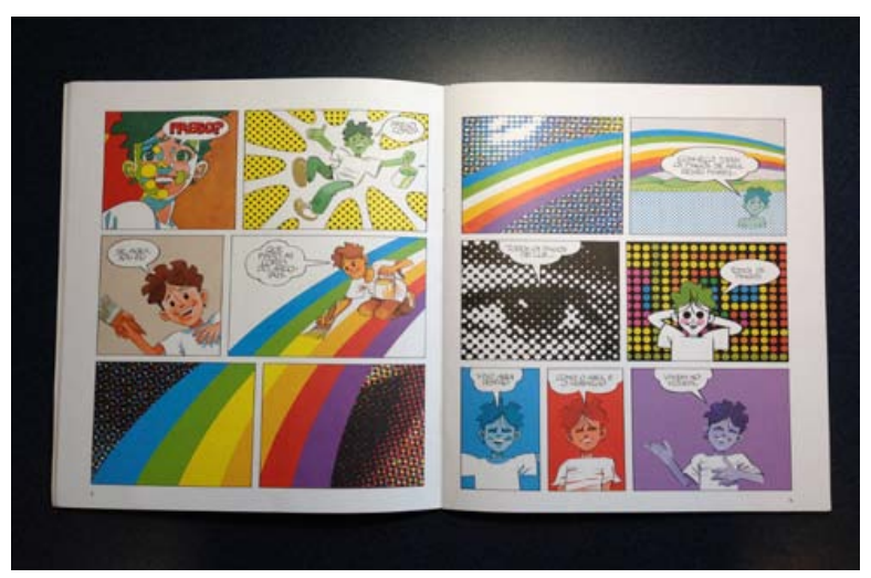
Figure 4: The Panel Boy , pages 8-9.

and on the linguistic level, as the representation of Ben-Dey dots, exhibiting the micro drops of ink as much bigger dotted patterns that superpose, make the printing process explicit.