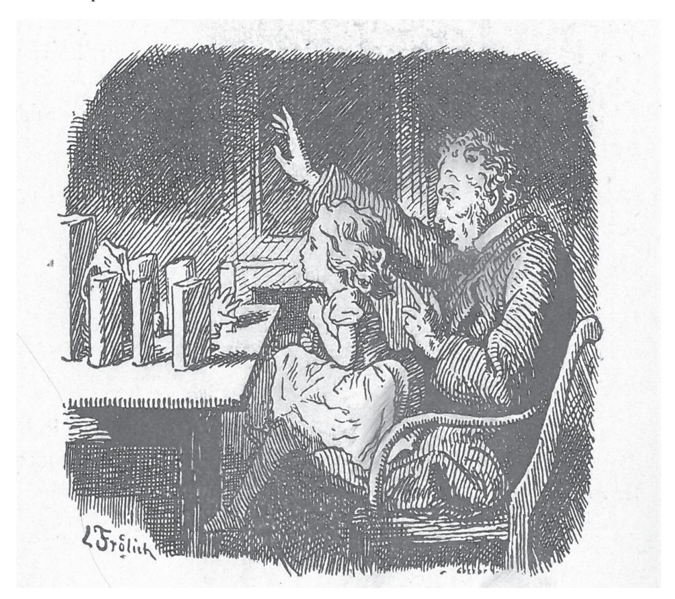
[Fig. 3: Lorenz Frølich's illustration for In the Children's Room]

oral, dramatic text created in cooperation between child and adult. Illustrator Lorenz Frølich captures the scene thus: